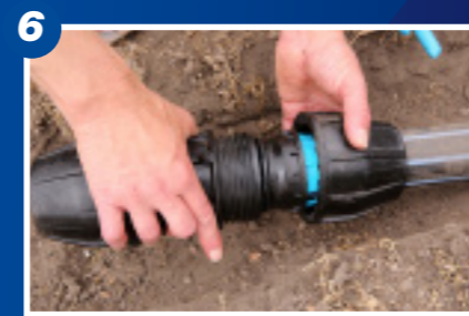
6 Insert the pipe into the fitting body ensuring pipe butts against tapered wedges in body of fitting. Bring the components up to the fitting body.