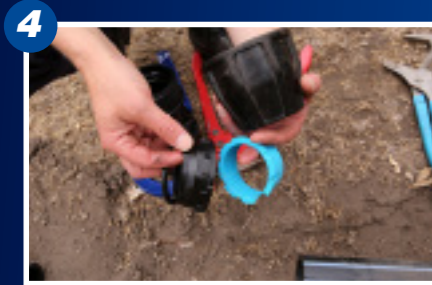
4 Remove the split ring and collet, ensuring you keep them together. Remove the O-ring.