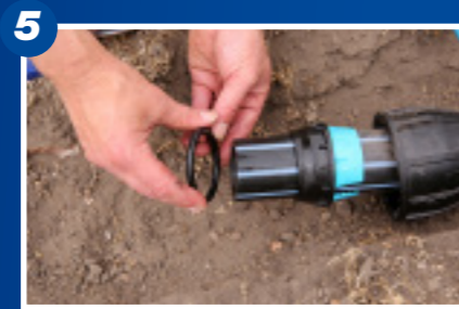
5 Slide the components onto the pipe, first the nut, then the split ring and collet followed by the O-ring.