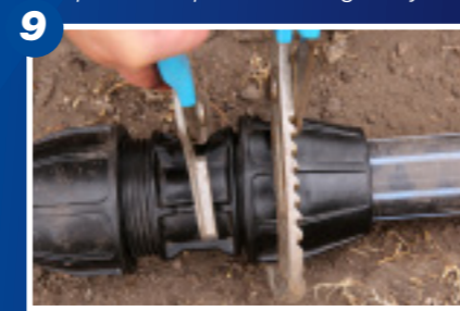
9 The fitting is now fully installed