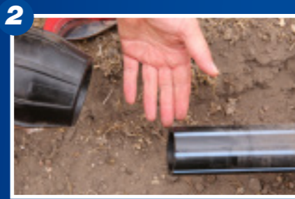
2 Cut the pipe square. There is no need to chamfer or lubricate the pipe.