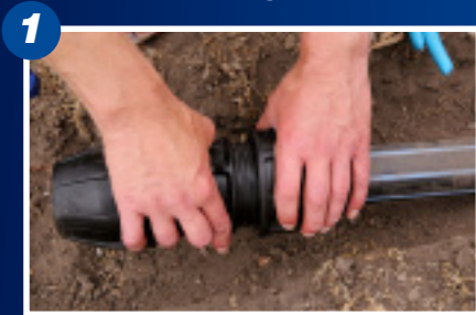
1 Use the multi-grips to loosen the nut then continue to loosen by hand and slide the body off the pipe.